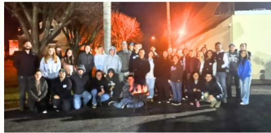
Thanks for joining us for our welcome back on January 11th!

Email dgermanneolassumption.net if you have any questions!