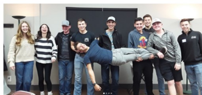
Thanks for joining us for our Youth Night!

All 8th-12th graders are welcome for dinner & our new series about topics that set us apart as Catholics. We will be discussing the Sacrament of Reconciliation.