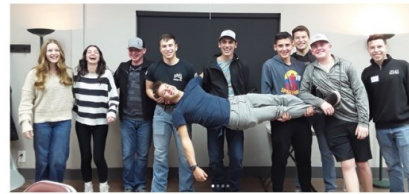
Thanks for joining us for our Youth Night!

We will be discussing about how we view the subject of death as Catholics.